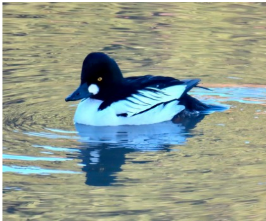
Common goldeneye male duck, Loma Vista Farm pond, Vallejo

From Marin and Sonoma Counties: From Hwy 37, turn left at Sears Point Rd. onto Hwy 12/121/Arnold Dr. Continue east on Hwy 121 to Duhig Rd. Follow directions above. From Napa: turn right from Hwy 29 onto Hwy 12/121 towards Sonoma. Turn left on Duhig Rd. Follow directions above.