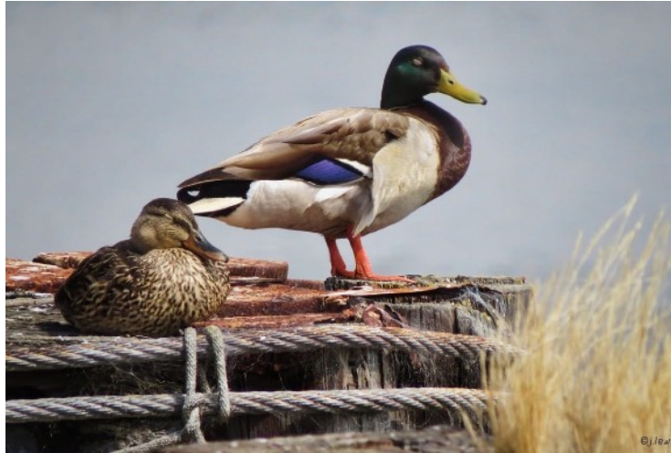
Photo: mallard pair, Mare Island

Walk the levee trail along this wetland transition zone restoration of a 348 acre tidal marsh habitat constructed by the U.S. Army Corps of Engineers in 1995. Directions: Turn south off Hwy 37 at Port Sonoma Marina, follow directional signs.