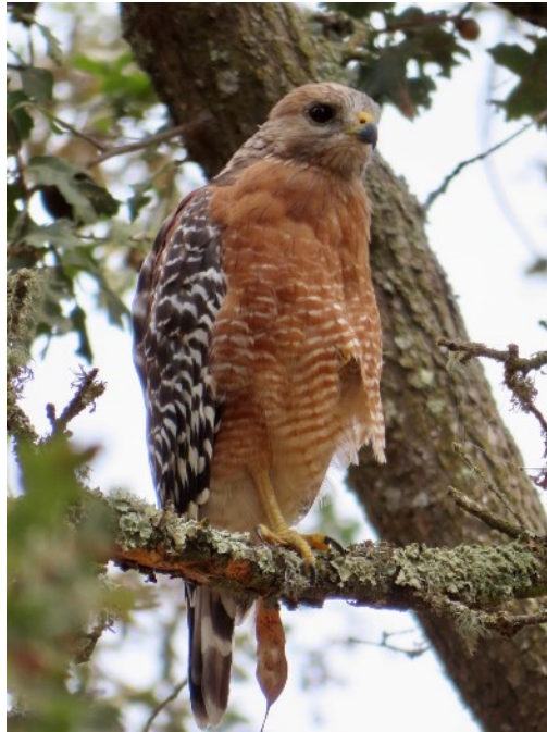
Photo: Young red-shouldered hawk

Join West County Hawkwatch Guides for a Birds of Prey Migration Hike featuring resident, migrating and over-wintering birds of prey hosted by Solano Land Trust and Solano County Parks. Over-wintering hawks are the highlight of this day. Lynch Canyon already boasts a large population of raptors, but over-wintering birds added in makes for a peak level of Hawks, Eagles, Falcons, Harriers, Accipiters, Kites