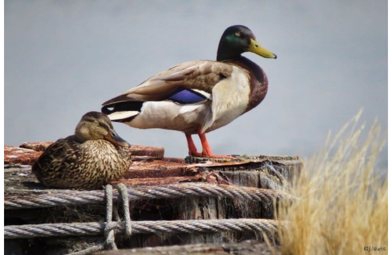
Photo: mallard pair, Mare Island