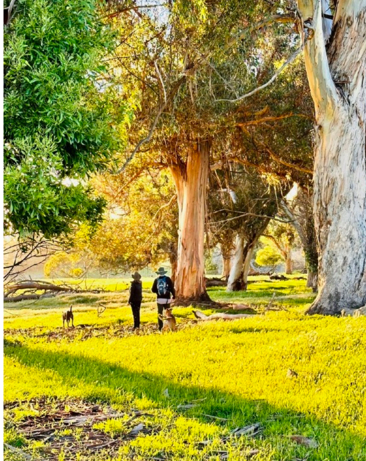
On a Ramble amongst the blue gum eucalyptus Mare Island Shoreline Heritage Preserve

Life has other plans. The car will not start. I was going to switch to the good old Toyota pickup and when I turned the key, the new battery was completely dead. So, back into the house I traped to make a cup of coffee and regroup. Settled in the car with my Merlin Bird ID App scanning the nearby trees, for the voices of songbirds, the front seat pushed back with