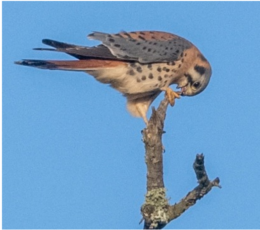
Photo: American kestrel, East Bay

As the weeks unfold, you will learn of plans we are making to host you in this year’s Go Wildly Live Outdoors Flyway Festival .