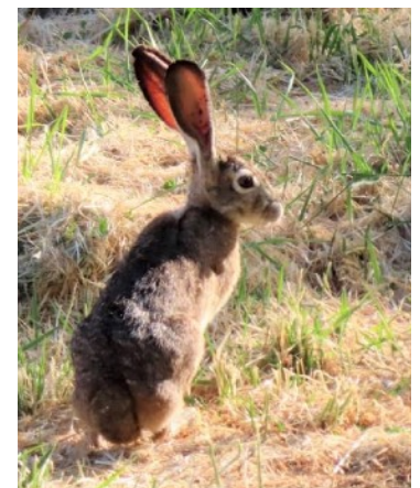
Wild jackrabbit in the Mare Island Shoreline Heritage Preserve. Virtually all rabbits on Mare Island have died this fall likely from Rabbit Hemorrhagic Disease Virus 2.(RHDV2)

We weep together, the Mother and I, as we find her precious bunny rabbits, dead by the hundreds, now, across the land from a manmade virus meant to kill only rabbits, for the greater good possibly, in Australia, but it has ravaged virtually all rabbit life wherever the "angel of death" touches their beings throughout Europe and now our country and our Island. (Continued, next page)