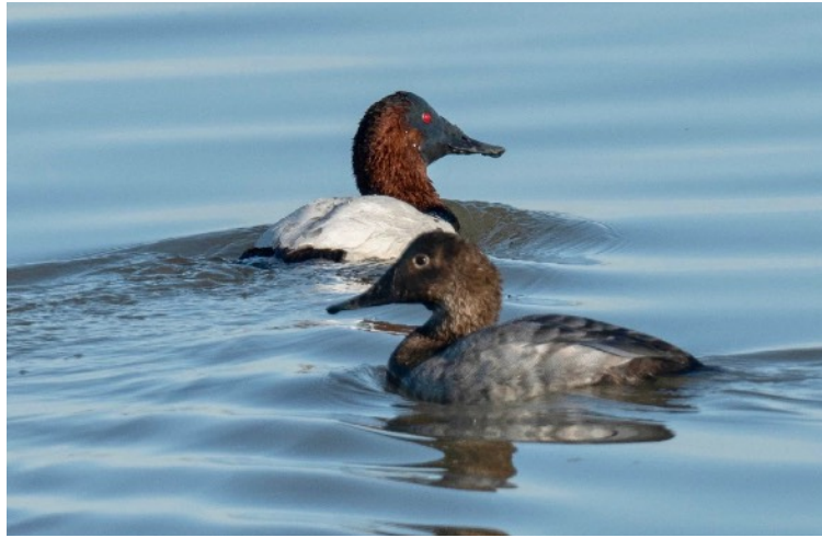
Photo: canvasback ducks along Highway 37

She blanketed the arroyo below our family home with blackberry thickets to endlessly pick the fruit from to return to turn a white painted and counter-topped kitchen purple with the juices converted to pies and jam in the heat of the summertime in the Sierra