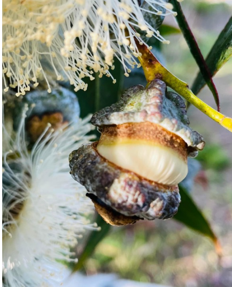
blue gum eucalyptus blossom unfurling Mare Island Shoreline Heritage Preserve

As I sat there in the dark and cold, hoping for another glimpse as she returned home from her errands, I was treated with a treasured moment every