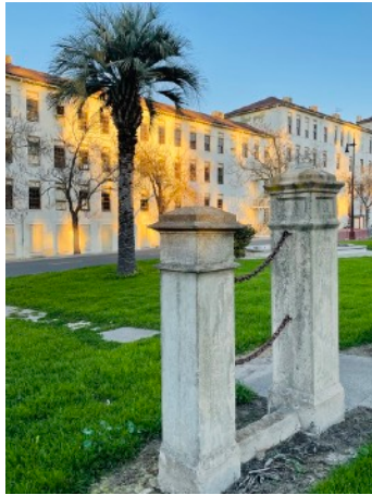
Photo: Former Naval Hospital, Touro University campus