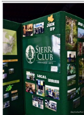
Photo: We are so thankful to the Sierra Club, Redwood Chapter for their role as HOST SPONSOR for 3 years and at the CHAMPION level this year and for the support and participation of the Sierra Club, Solano Group for 28 years! 2019 Flyway Festival