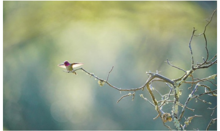
Photo: Hummingbird takes flight, in the East Bay