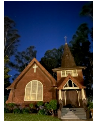
St Peter's Chapel, Mare Island

south of the historic Captain's Row mansions on Mare Island. $5.00 per person donation. (Under 12, free).