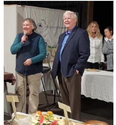
Photo: Now Mayor Robert McConnell attending our opening reception as a Councilmember, 2019

Sonoma: From Hwy 37 Eastbound, take the Mare Island exit immediately before the Napa River Bridge. Veer right onto Walnut Ave. At the stop sign, turn left 2 blocks through the flashing stop light at Railroad Ave. to Nimitz Ave. Turn