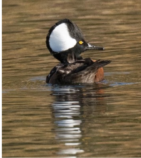
Photo: Male Hooded Merganser Lake Solano

Directions: From northbound Highway 29 in American Canyon, turn onto Paoli Loop Road/Green Island Road. (From south turn onto Paoli Loop Road .08 miles north of Walmart and follow Paoli Loop under Hwy 29). At stop sign turn left onto Green Island Rd. Proceed straight for 0.9 miles. At 2nd stop sign turn right continuing on Green Island Rd. straight for one long block; continue as it turns left, then approximately 1.4 miles to end. Turn left into the park driveway at Napa-Sonoma Marshes Wildlife Area, Green Island Unit sign. Follow the driveway around to the parking lot.