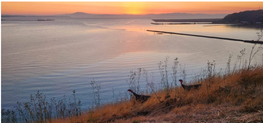
Photo: San Pablo Bay, Mt. Tamalpais and the setting sun from the east side of the Napa River mouth with Mare Island Shoreline Heritage Preserve to the west side of the mouth of the Napa River, Clifford Johnson

gantries to Building 34, 1024 Nimitz Ave. Mare Island From Napa: From Hwy 37 Westbound, take the Mare Island exit immediately after the Napa River Bridge. Veer right off the off-ramp, looping over the overpass onto Walnut Ave. Continue to the first stop sign. Turn left 2 blocks through the flashing stop light at Railroad Ave. to Nimitz Ave. Turn right onto Nimitz Ave. Follow it to the deadend. Park anywhere in the ample parking spots. Walk south towards the Buildingways and gantries to Building 34, 1024 Nimitz Ave. Mare Island Lost? Call/text 707-249-9633.