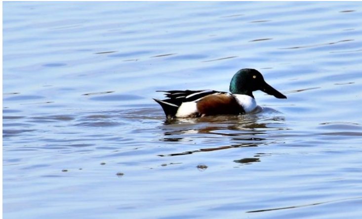
Photo: northern shoveler, American Canyon Wetlands

From Napa: turn right on Rio Del Mar, make a sharp right on Eucalyptus Dr.; drive to the end.