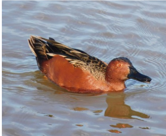
Photo: male cinnamon teal, Wetlands Edge Trail American Canyon

Directions: Meet at the parking lot at the corner of 2 Eucalyptus Drive and Wetlands Edge Rd. Wetlands Edge Park in American Canyon From Highway 29 coming from Vallejo: turn left on West American Canyon Rd. Drive to end and turn right on Wetlands Edge Rd. Drive to the end and turn left on Eucalyptus Dr. From Napa: turn right on Rio Del Mar, make a sharp right on Eucalyptus Dr.; drive to the end.