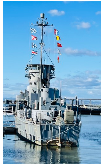
Photo: LCS-102, WWII Landing Craft Support Gunboat, Berth 6, Mare Island

Directions: From the Blue Bridge, G. St/Wichels Causeway: Turn left onto Nimitz Ave. Look for a wayfinding sign on your right showing LCS-102. Turn left at A St. Berth 6, A St @ Nimitz Ave. Mare Island . Continue to Berth 6. Park in parking lot near dock and boat.